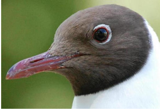
Black headed gull